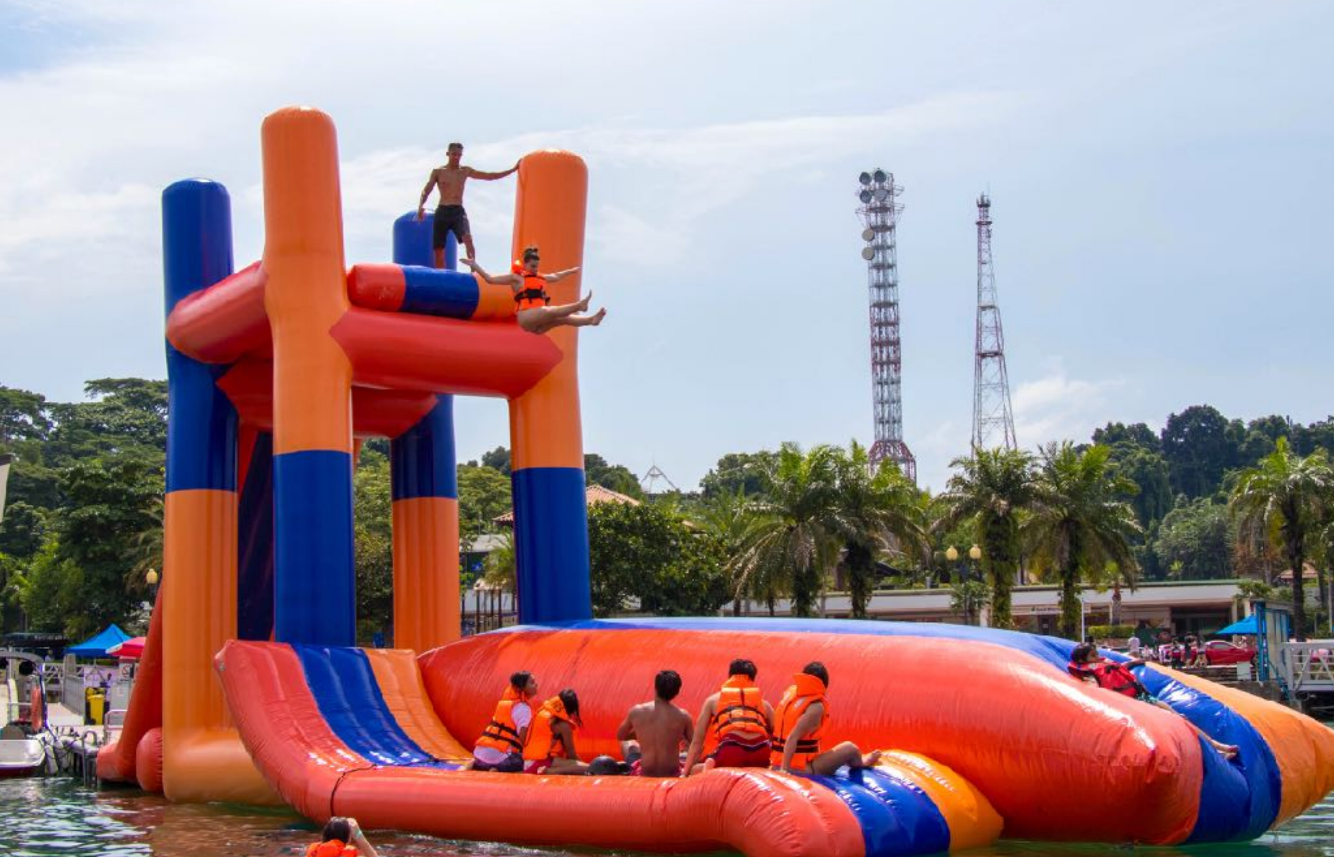
Floating Castle Renal