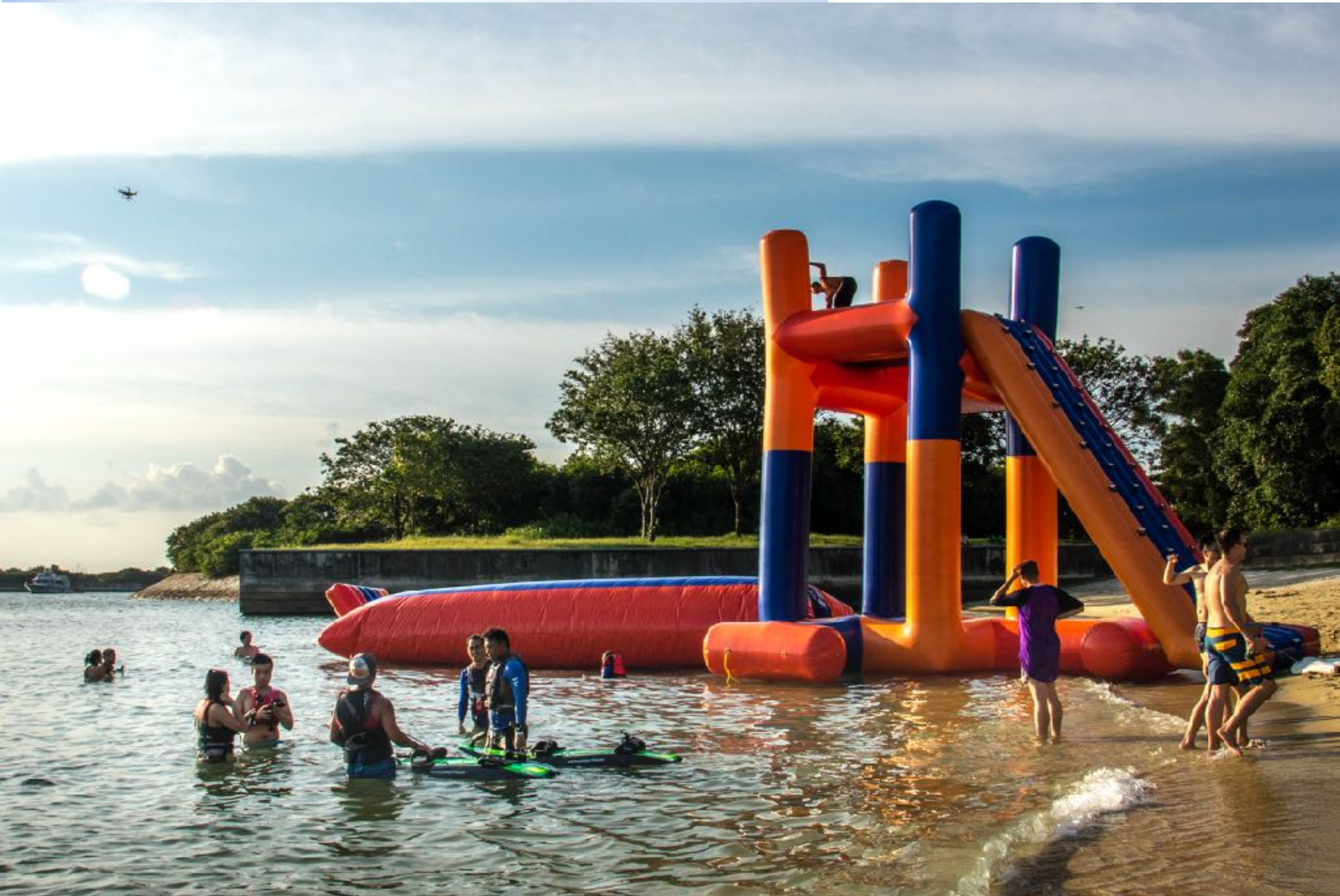
Floating Castle Renal